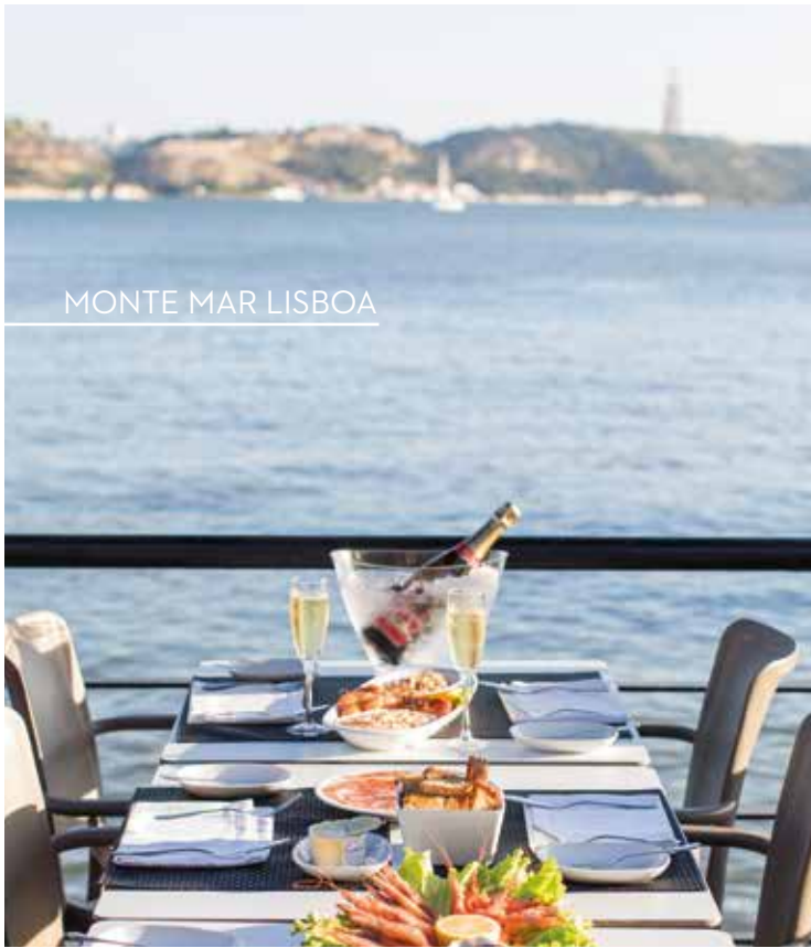
MONTE MAR LISBOA