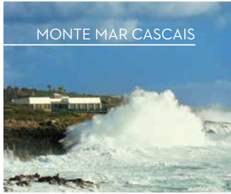
MONTE MAR CASCAIS