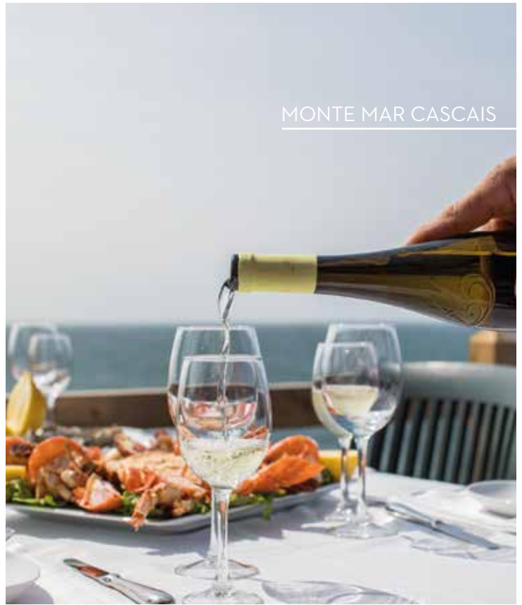
MONTE MAR CASCAIS